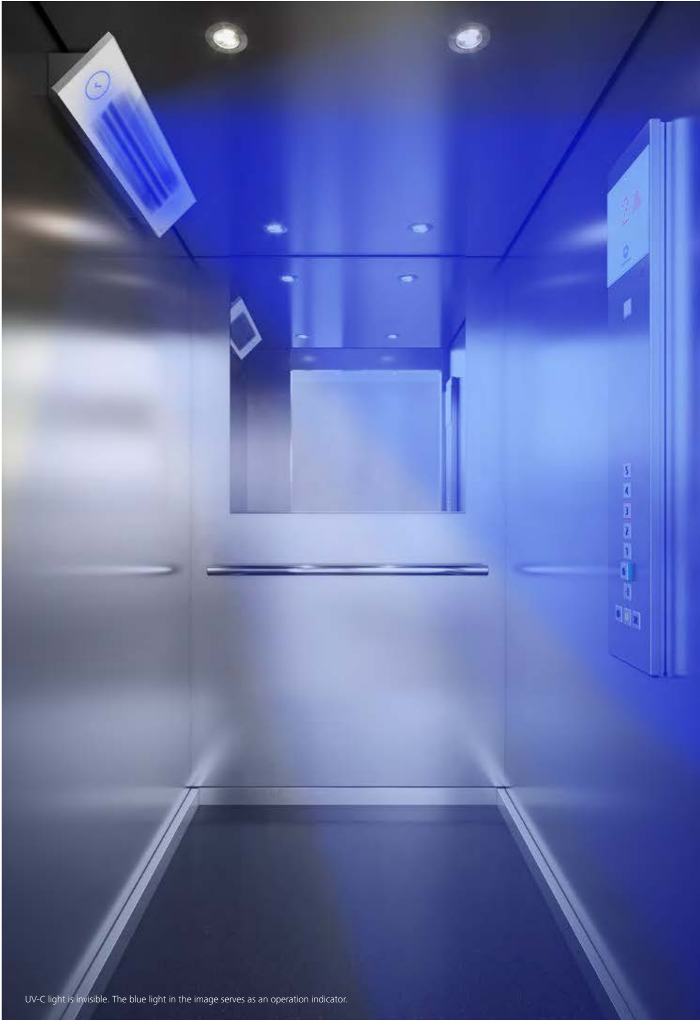
UV-C light is invisible. The blue light in the image serves as an operation indicator.